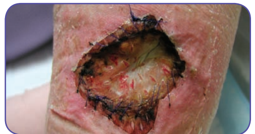
Figure 2. 1 week post-op