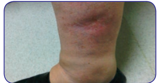
Figure 5. Final follow up. 22 weeks post-op.

Closure of the large trauma wound was accomplished 22 weeks following a single application of Unite® Biomatrix. Significant reconstitution of the tissue volume deficit by tissue re-growth was reported. The cosmetic appearance was acceptable in light of the original defect. No dressings other than dry gauze were needed after placement of the xenograft.