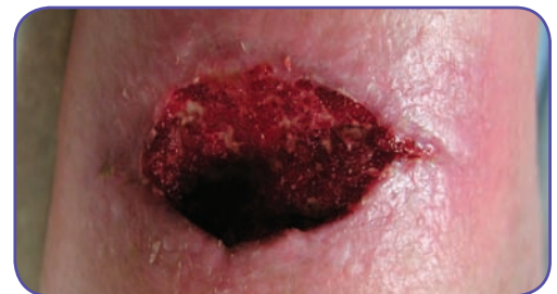
Figure 1. Initial presentation of trauma wound

A fenestrated 6cm x 6cm Unite® Biomatrix was circumferentially secured to the edges of the wound using a 3-0 Prolene™ suture (Ethicon). Care was taken to ensure Unite® Biomatrix was in intimate contact with the entire wound bed and there was 1-2cm excess border beyond the wound margins. A 4-0 Monocryl™ suture (Ethicon) was used to secure the graft at two points in the center of the wound to assist secure contact to the entire wound surface. A non-adherent dressing was then applied over Unite® Biomatrix, followed by a sterile dressing. An elastic bandage was used to apply compression.