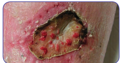
Figure 3. 3 weeks post-op