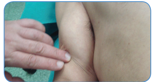
Figure 1. Visible deformity of the biceps muscle

It was decided to augment the repair with an OrthADAPT® Bioimplant from Synovis Orthopedic & Woundcare, Inc. A 2 cm x 15 cm bioimplant was prepared in the prescribed manner. With traction on the biceps tendon, the bioimplant was wrapped 270° and secured around its periphery using #2 Ethibond® non-absorbable suture. Care was taken to apply maximum tension to the OrthADAPT® Bioimplant while suturing to create a low profile repair and to maximize contact with the tendon. This new construct was then ready to be passed through a transosseous tunnel and secured.