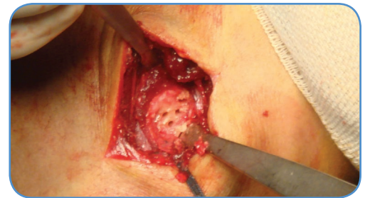
Figure 5. Drill holes in radial aspect of tuberosity.