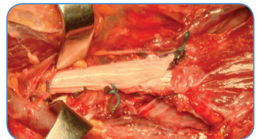
Figure 6. Completed repair of biceps tendon using the OrthADAPT® Bioimplant.