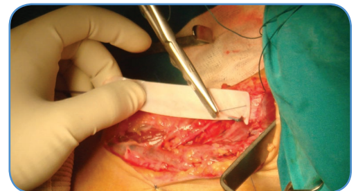
Figure 3. Initial suturing of the OrthADAPT® Bioimplant.